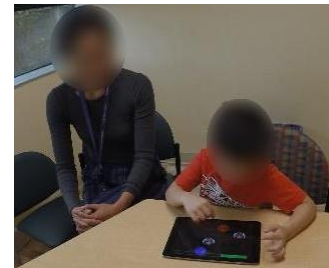
Figure 2. Participant Playing the Game in Lab Setting with the Experimenter

During the game session, the experimenter observed participants' behavior and guided them along if they could not understand the rules. Experimenter and parent interference was documented in run logs. After the experiment, experimenters would briefly interview selected participants about the game. Participant comments about the game were recorded (e.g. “want more sound”, “too easy”, “enjoyed it!”, etc.).